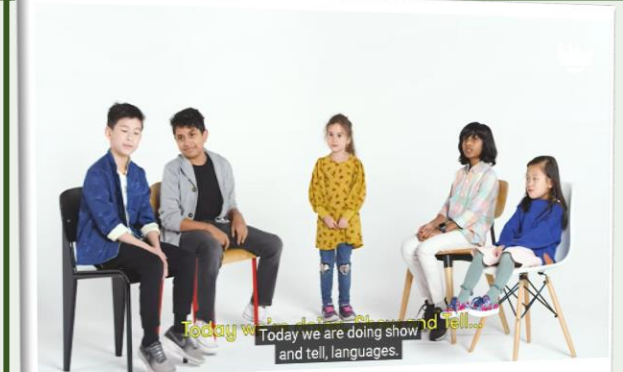
#HiHoKids #ShowandTell Show and Tell Foreign Languages | Show and Tell | HiHo Kids

Click here to listen to Show and Tell Foreign Languages. Are you able to roll your r's? Ask a family member or friend who speaks another language to translate some of your favorite words and phrases.